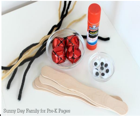
1. Sunny Day Family for Pre-K Pages